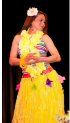
Local Global Event See page 10

Welcome to our new style newsletter! Change seems to be the most consistent thing in the voluntary sector at the moment and this newsletter format is no exception. Over the next few issues we will be trying different layouts to find the most user-friendly one. We would welcome your feedback so we can keep improving both the format and the content. Please feel free to copy this and distribute to your colleagues and volunteers.